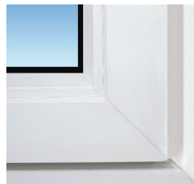
Bottom corner - PVCu