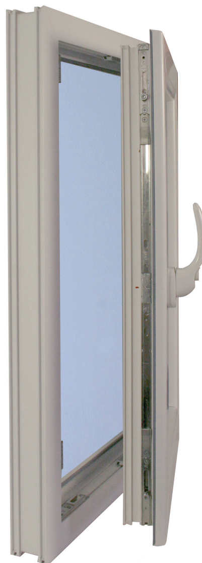
Turn position for cleaning