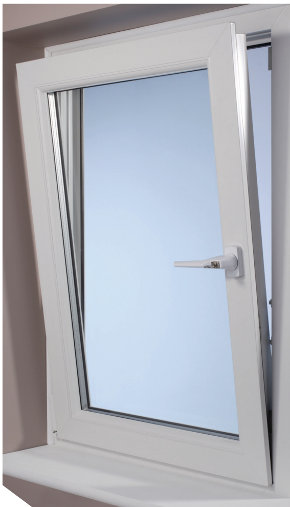
Tilt position for ventilation

Maco Multi Matic Invisible is open in only, has a tilt mode position for ventilation and a turn mode for cleaning. An enhanced security version is available to comply with PAS 24.