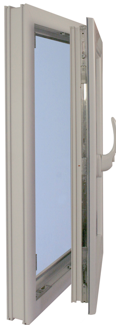
Turn position for cleaning