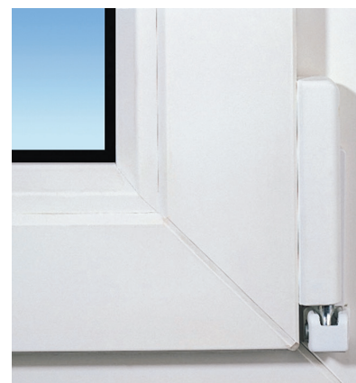
Bottom hinge - PVCu