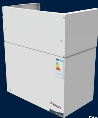
Straight Duct Cover