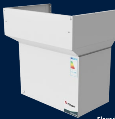
Flared Duct Cover